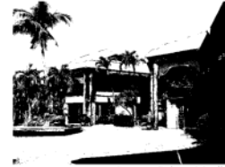
Coconut Palace, Manila