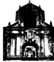
Fort Santiago in Manila

Polo barón is a short-sleeved version of the traditional barong Tagalog . The barong Tagalog is a long-sleeved, usually embroidered dress shirt worn on formal occasions; traditionally it is white, although some are now also available in pastel colors. These shirts are worn over pants and without a tie.