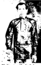
Philippine "Indio" dressed in "Barong Tagalog" Photo: Biblioteca Nacional de Madrid Public Domain