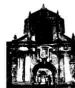
Fort Santiago in Manila

Pagkain means "food." Anong gusto ninyong pagkain? literally means "What food would you like?"