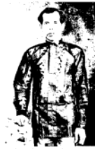
Philippine "Indio" dressed in "Barong Tagalog"