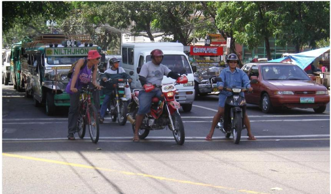
Traffic in Cebu-City, Gorordo Avenue, Escario Street, near the Social Security System Building

1 liter is about 1 quart (1.057 liquid quarts or 0.2647 gallons).