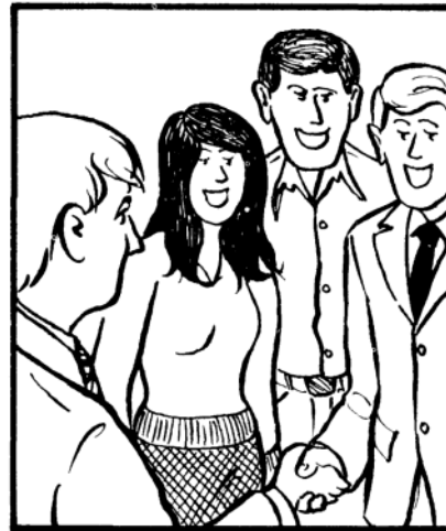
Magandang umaga sa inyong lahat.