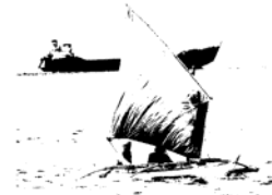
Sailboat in Cebu Strait off the coast of Mactan