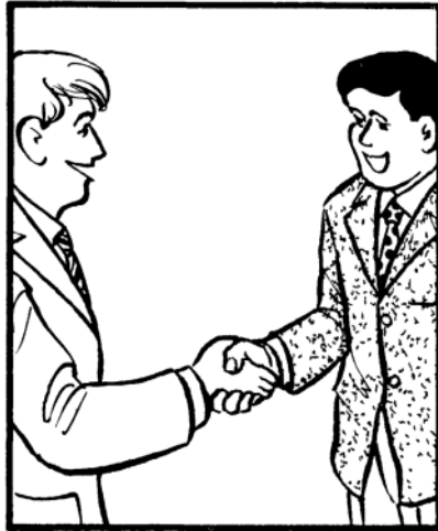
Magandang umaga sa inyo.